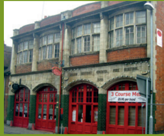
Old fire station.

The Symington Building, where you began the trail, is across Church Square.