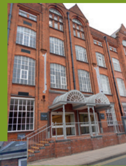
The Symington Building.