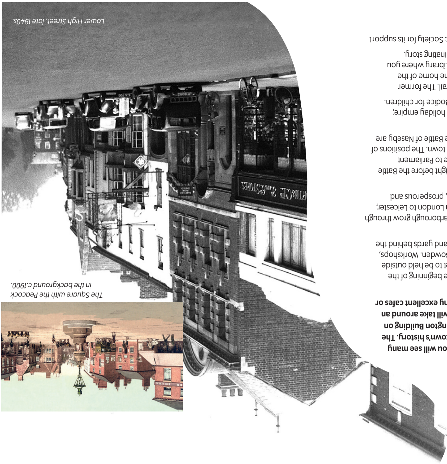
Lower High Street, late 1940s.