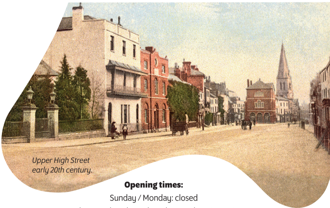
Upper High Street early 20th century.