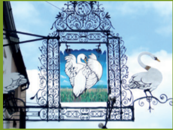
Three Swans Hotel.