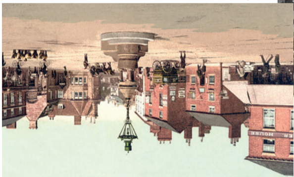
The Square with the Peacock in the background c.1900.