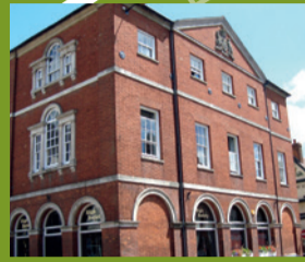
Old Town Hall.