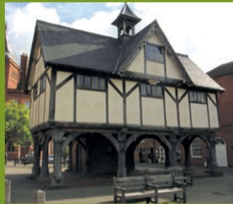
Old Grammar School.